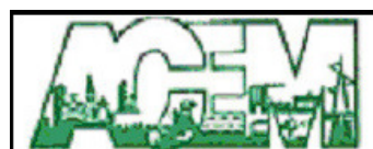
Association of Consulting Engineers Malaysia