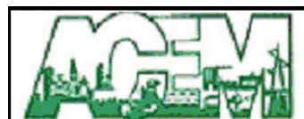
Association of Consulting Engineers Malaysia